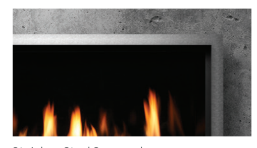
Stainless Steel Surrounds OFP43SS, OFP55SS, OFP79SS